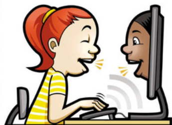
A Parent's Guide to Social Media